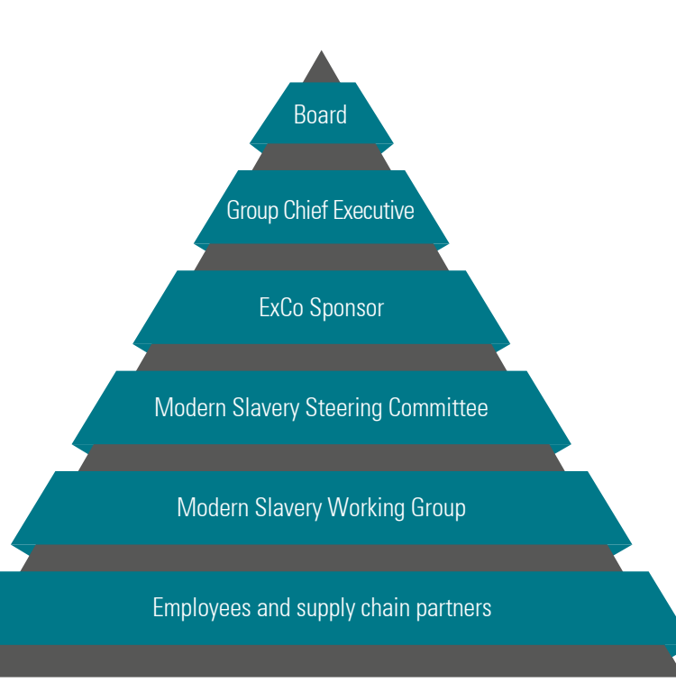
Balfour Beatty's modern slavery governance structure

Acknowledging the significance of managing modern slavery, a Modern Slavery Steering Committee was established in October 2022. The committee is responsible for overseeing the expansion of the Modern Slavery Working Group and the programme of activities that address Group risks. It comprises senior representatives from various business functions providing overall oversight and governance of modern slavery risks.